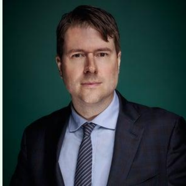
Whitney Snyder Editor-in-Chief HuffPost