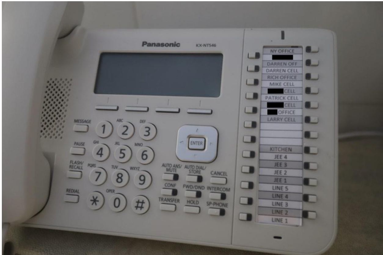
A telephone with various speed-dial notes located on a private island formerly owned by sex offender Jeffrey Epstein is pictured in a photo released by the House Oversight Committee.