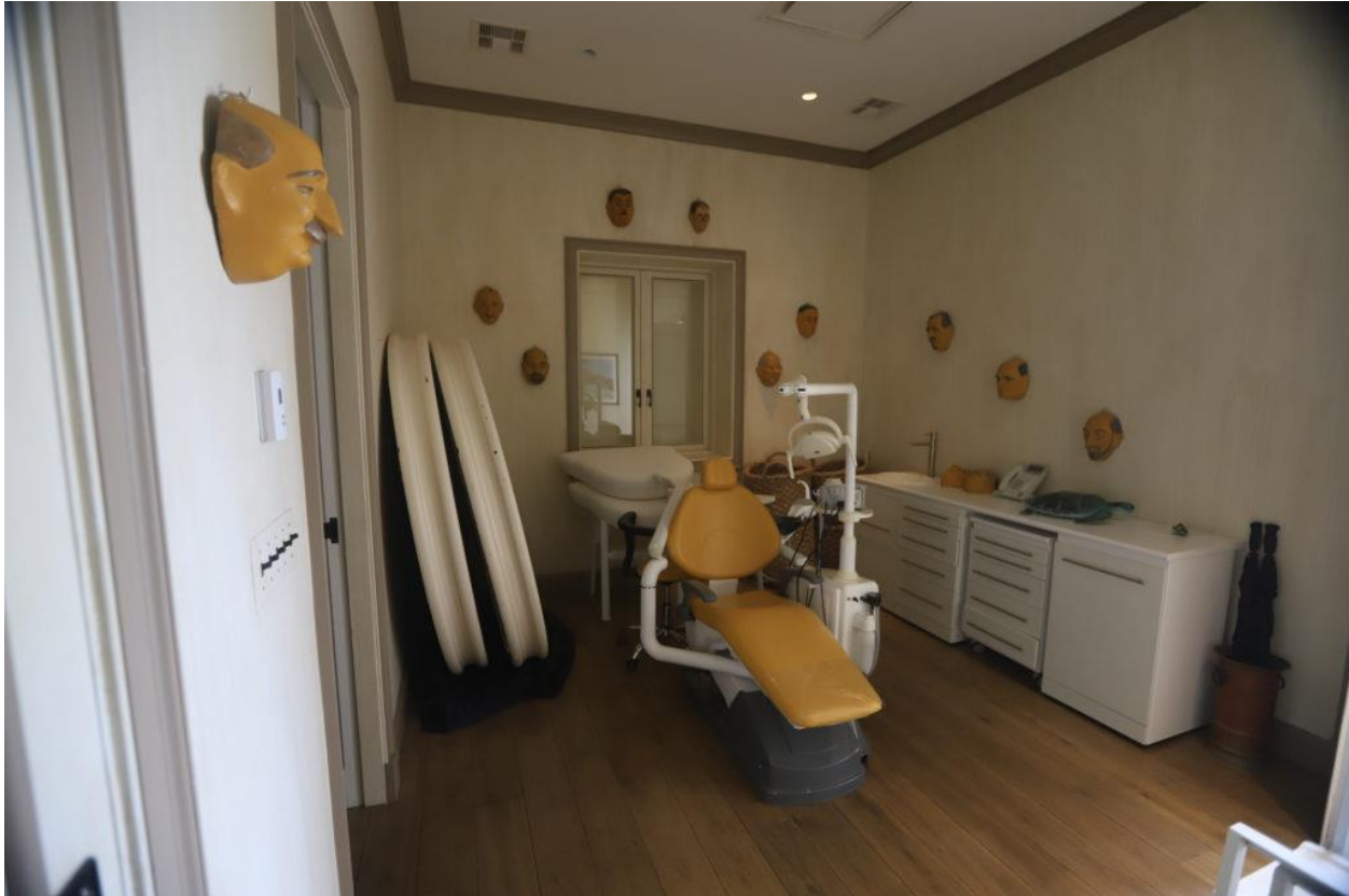
An room containing a dentist's chair located on a private island formerly owned by sex offender Jeffrey Epstein is pictured in a photo released by the House Oversight Committee.

Epstein's connections to the island territory have come under renewed scrutiny. A cache of correspondence released last month revealed Epstein had texted with U.S. Virgin Island Delegate Stacey Plaskett in February 2019 during a congressional hearing. In response, Plaskett faced a censure vote in the House, which broke 209-214 in her favor. She defended herself from wrongdoing, saying, "I know how to question individuals. I know how to seek information. I have sought information from confidential informants, from murderers, from other individuals because I want the truth."