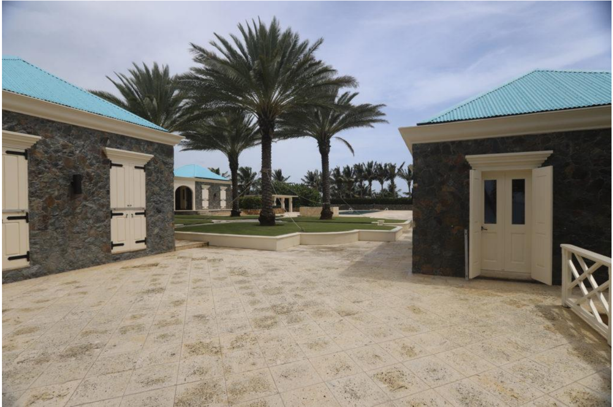
An exterior view located on a private island formerly owned by sex offender Jeffrey Epstein is pictured in a photo released by the House Oversight Committee.

Islands announced a civil settlement of more than $150 million with Epstein's estate and other co-defendants, related to sex trafficking, child exploitation and fraud claims filed in 2020.