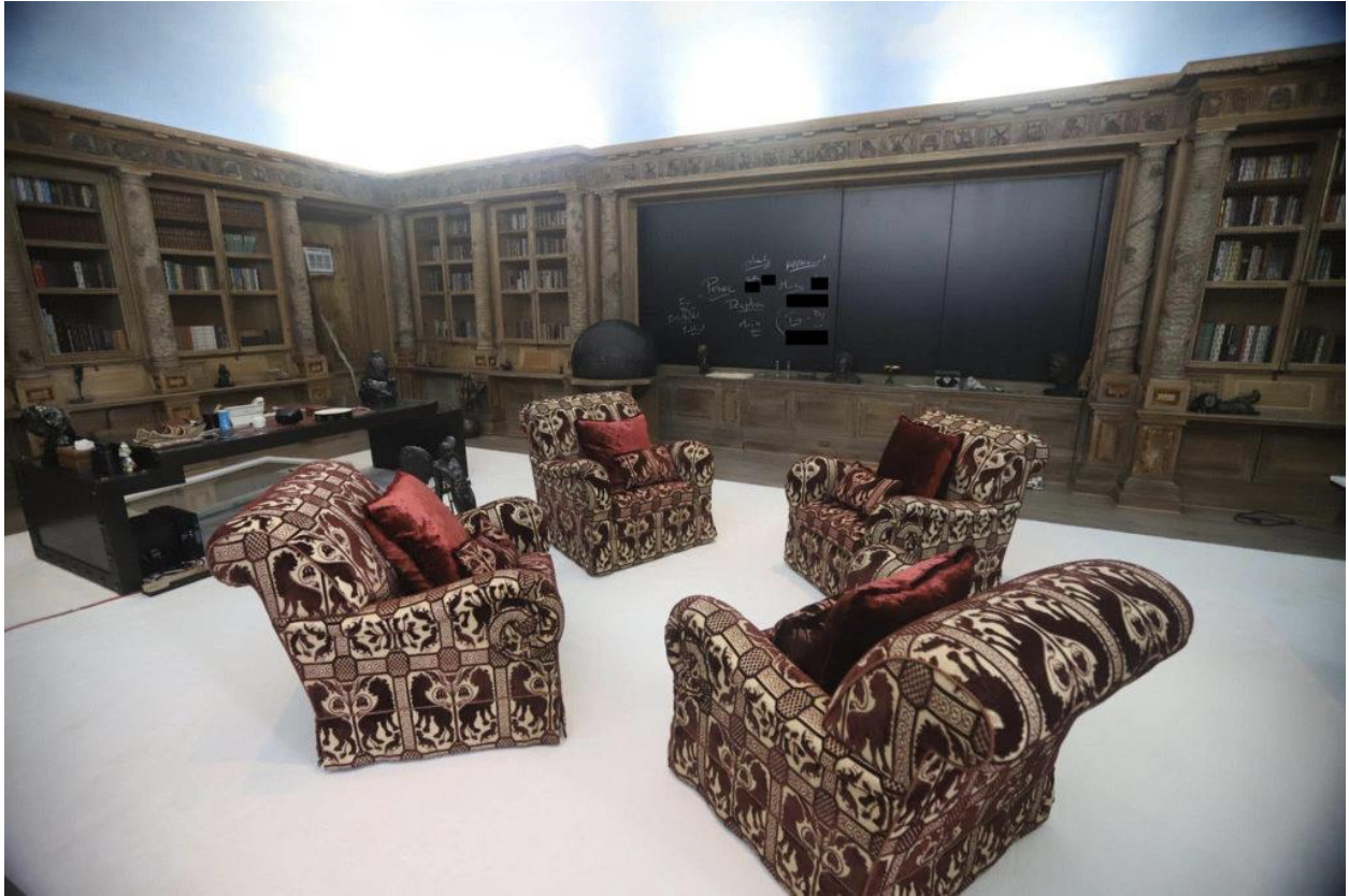
A living space located on a private island formerly owned by sex offender Jeffrey Epstein is pictured in a photo released by the House Oversight Committee.