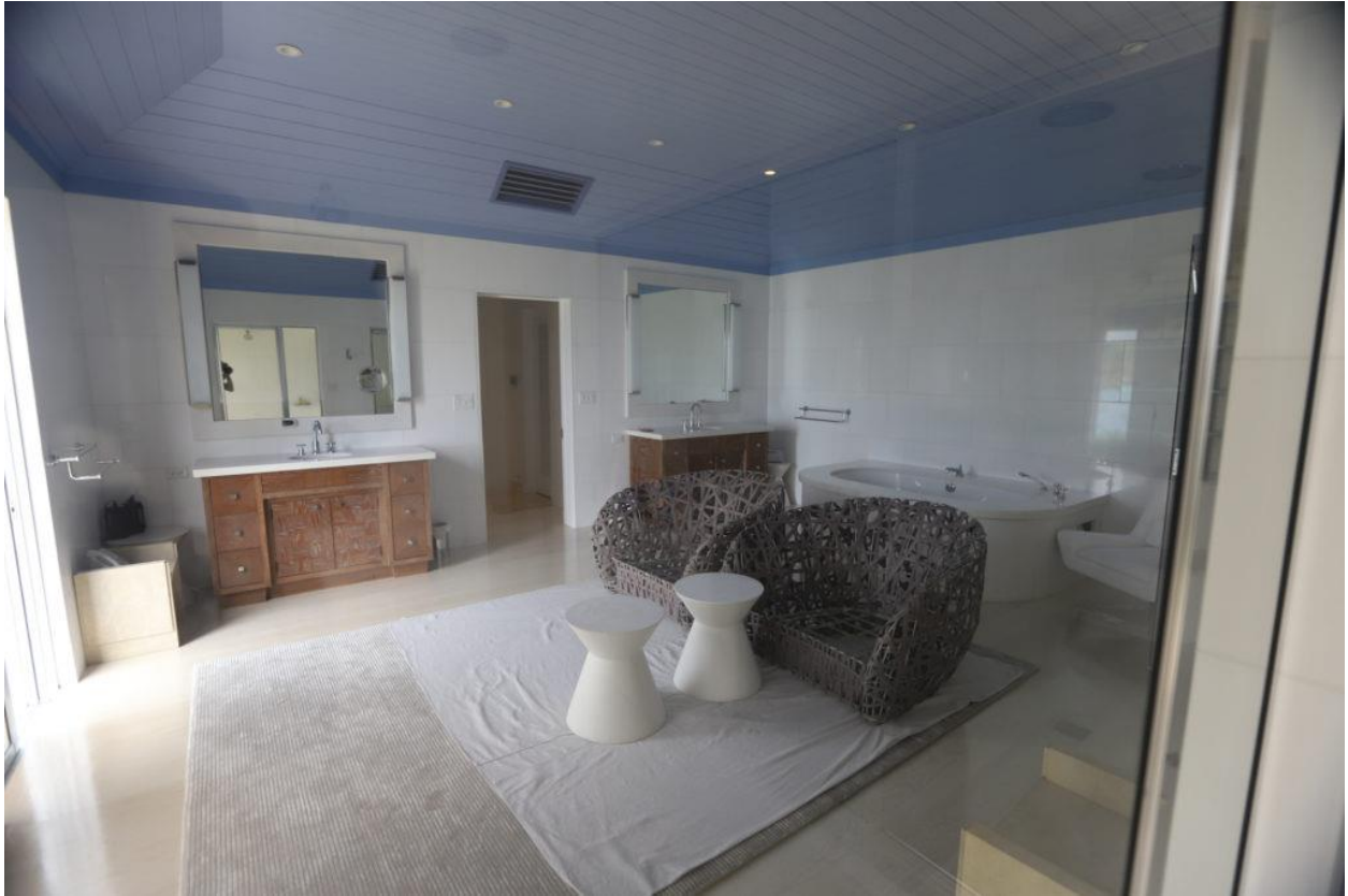
A bathroom located on a private island formerly owned by sex offender Jeffrey Epstein is pictured in a photo released by the House Oversight Committee.