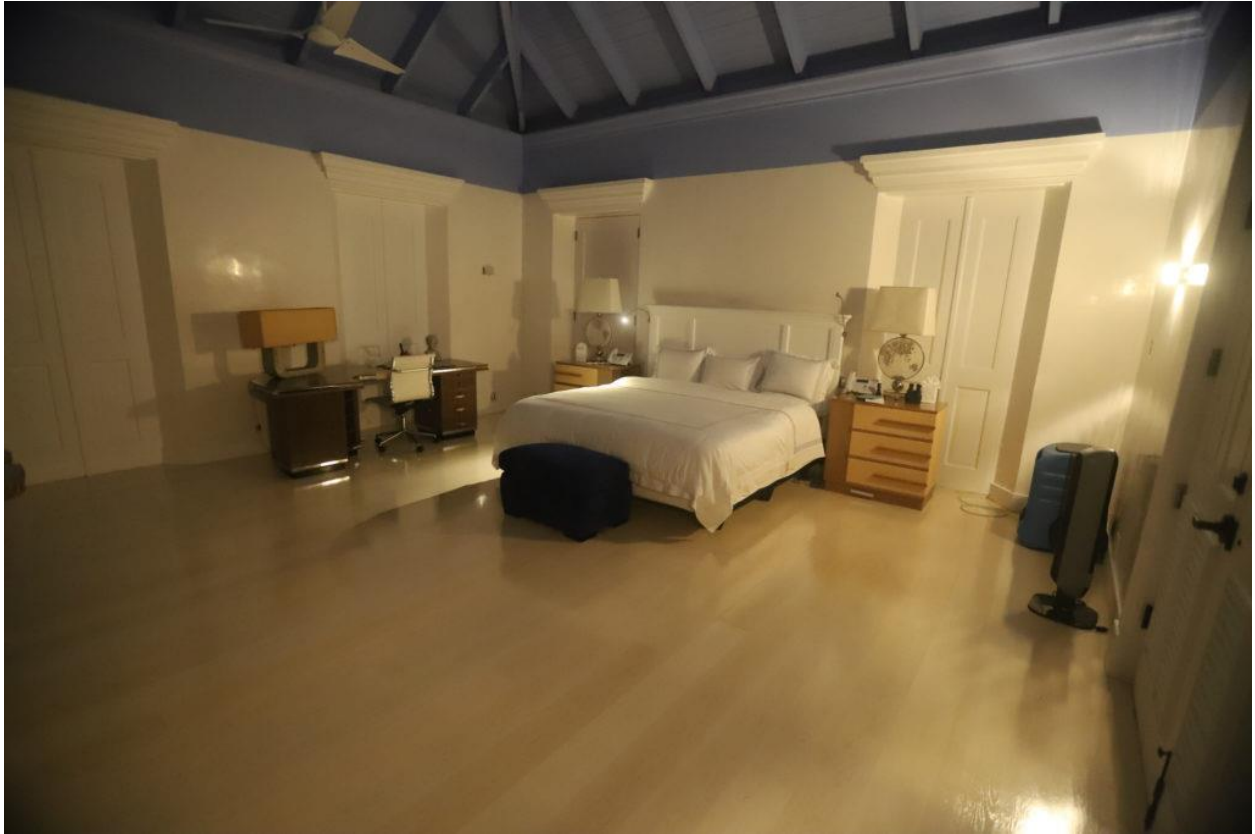
A bedroom located on a private island formerly owned by sex offender Jeffrey Epstein is pictured in a photo released by the House Oversight Committee.