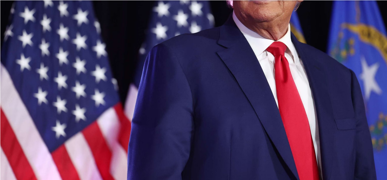
Former President and Republican presidential candidate Donald Trump prepares to deliver remarks at a Nevada Republican volunteer recruiting event at Fervent: A Calvary Chapel on July 8, 2023, in Las Vegas.

The court said it would consider the request on an expedited basis.