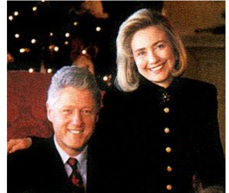
Bill and Hillary Clinton