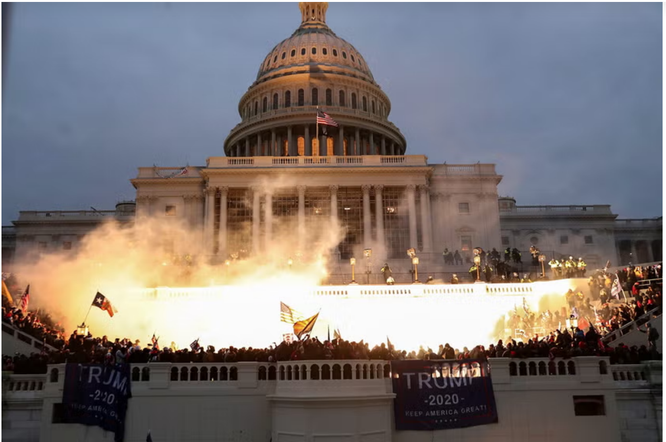
An explosion caused by a police munition is seen while supporters of U.S. President Donald Trump gather in front of the U.S. Capitol building.