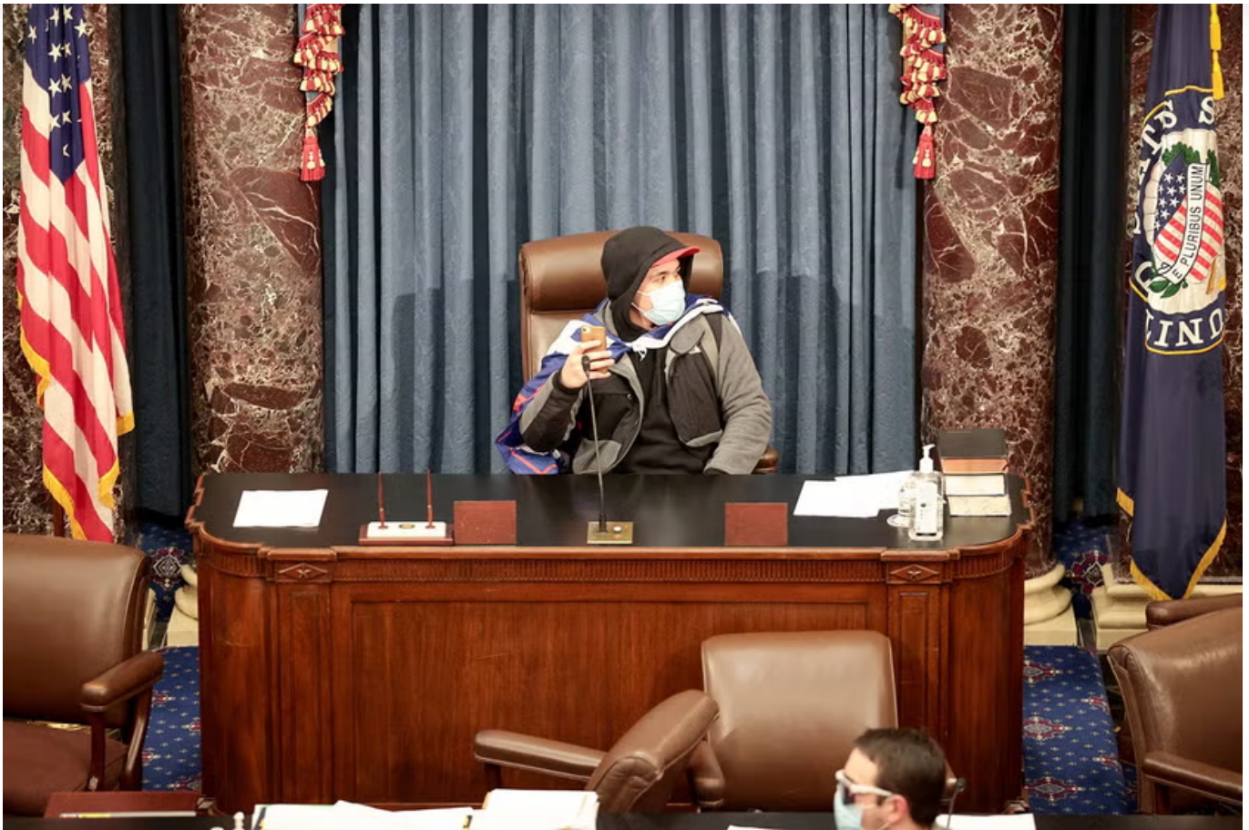
A Trump supporter sits in the Senate chamber in Washington, D.C.