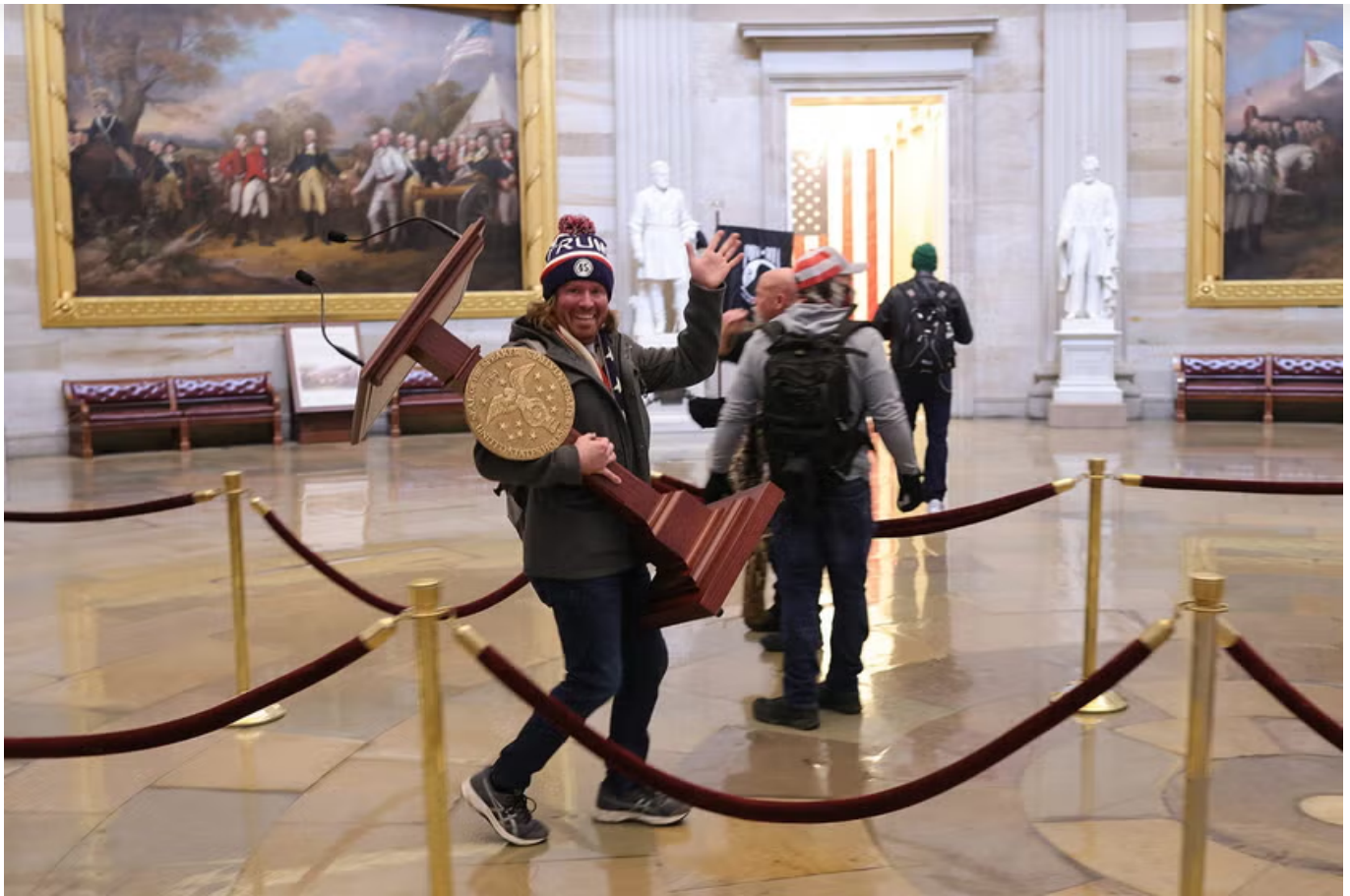
A smiling supporter of Donald Trump holds a Speaker podium inside the Capitol and waves at photographers.