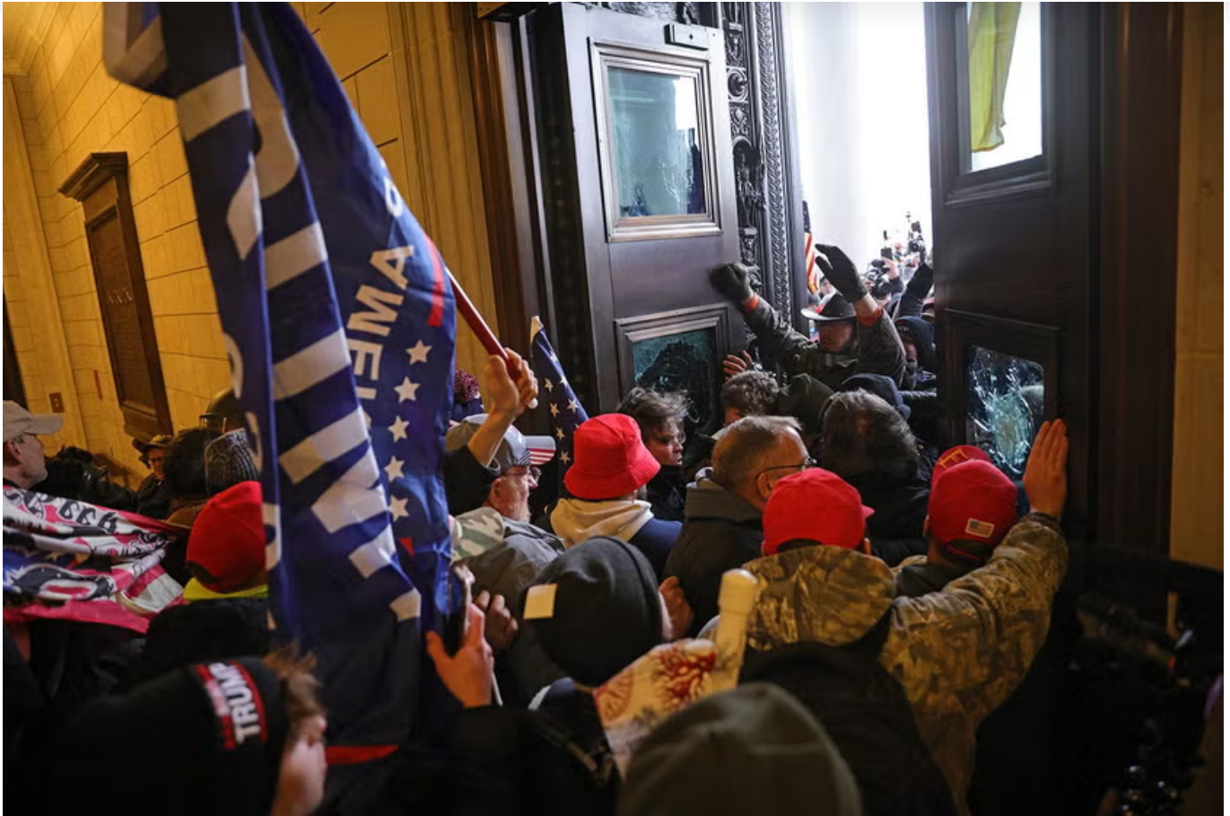
Rioters break into the U.S. Capitol.