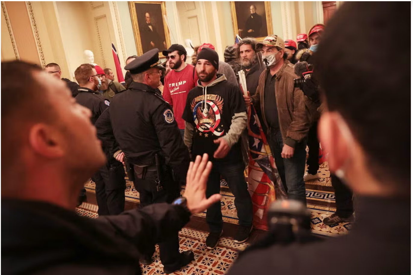
A Capitol police officer engages with a man wearing a QAnon T-shirt inside the U.S. Capitol Building.