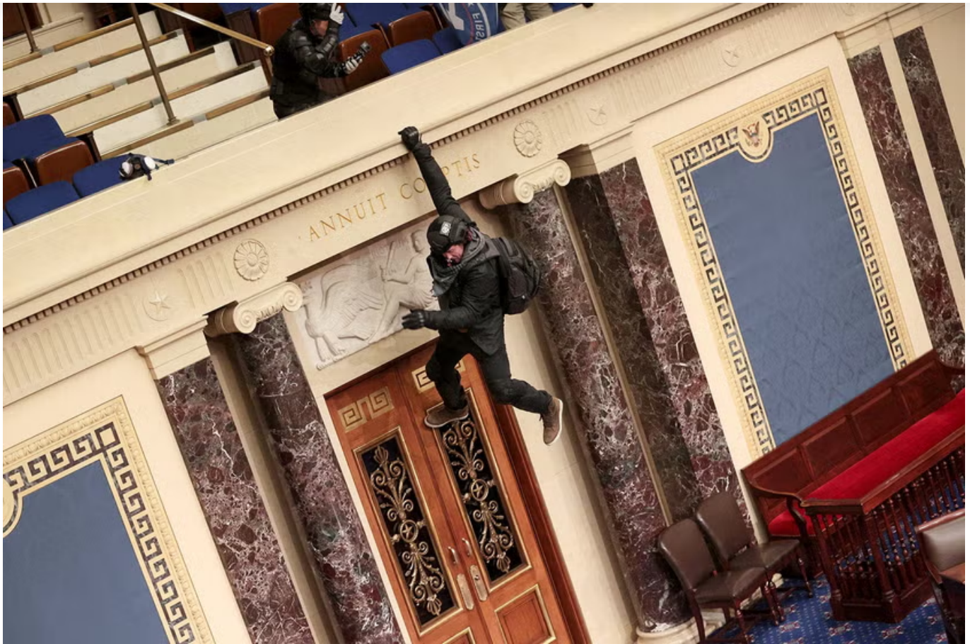
A man hanging from the balcony in the Senate chamber.