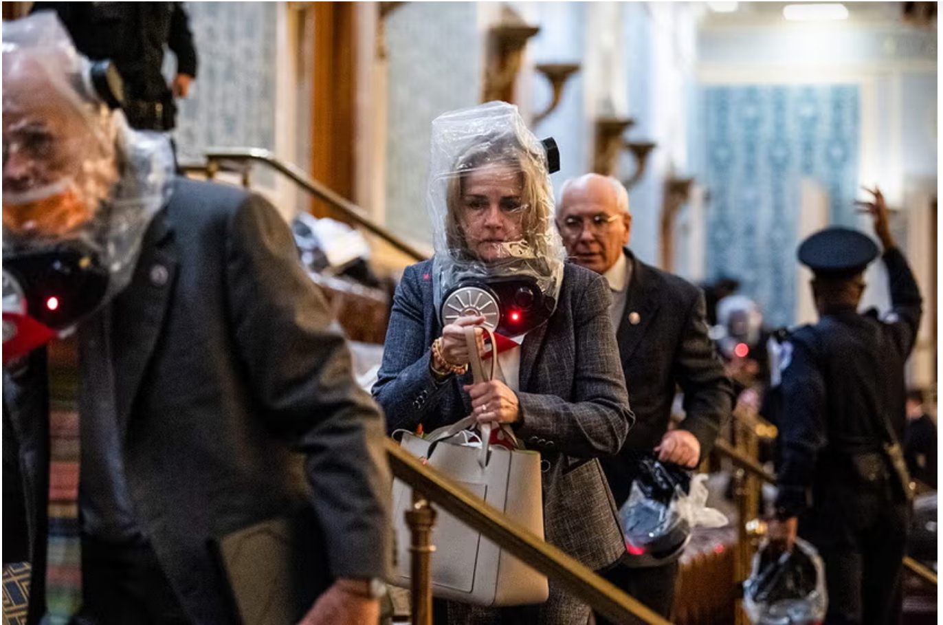
Rep. Madeleine Dean, D-Pa., and other members take cover as supporters of Trump storm the Capitol.