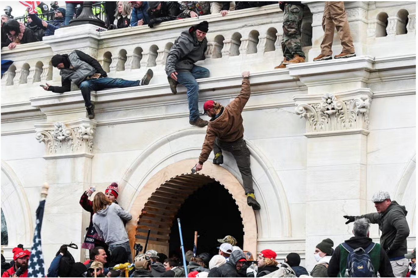
Trump supporters climb up the U.S. Capitol's walls.