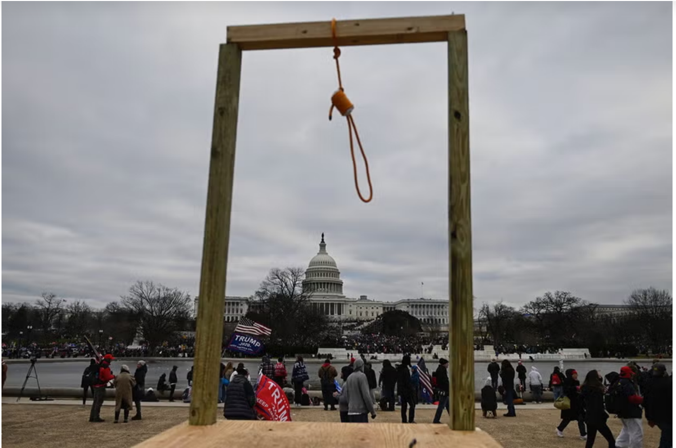
A noose hangs outside the U.S. Capitol.