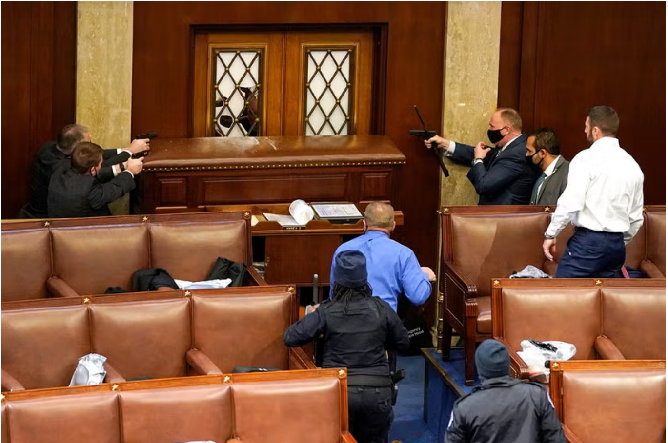
U.S. Capitol police officers point their guns at a door that was vandalized in the House Chamber.