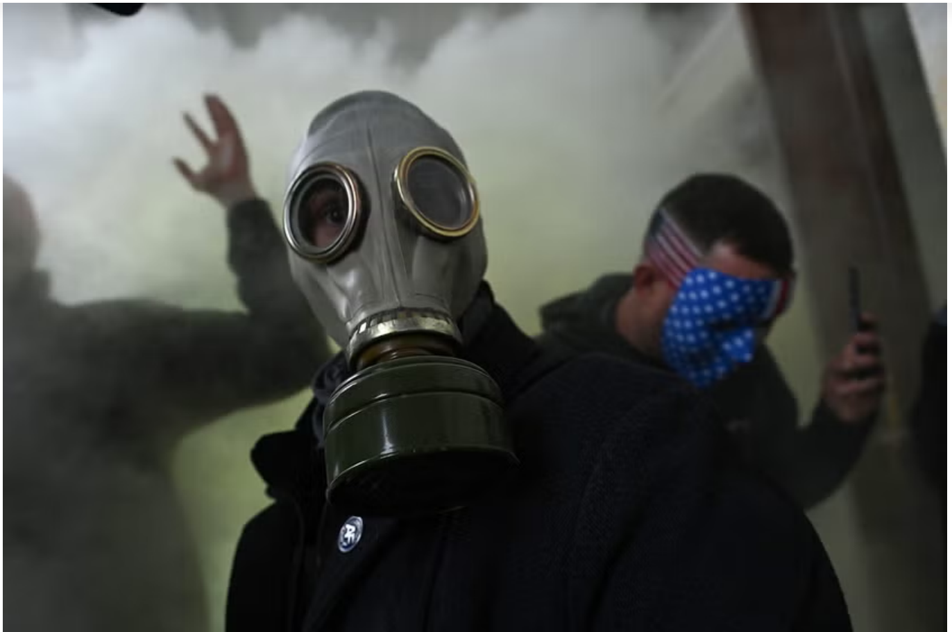
A man in a gas mask in Washington, D.C.