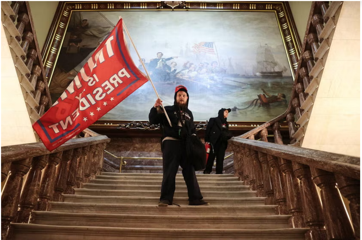
A man holds a Trump flag inside the Capitol on Wednesday.