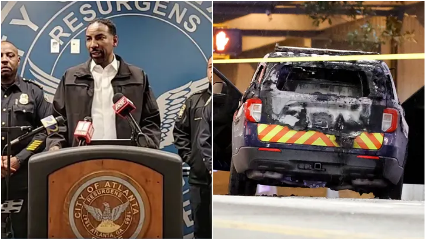
Atlanta Mayor Andre Dickens said he will not tolerate violence or property destruction.

"And so our police department, along with our state and federal partners, took swift action within two blocks and brought that situation under control," Dickens said Sunday. "And the violence stopped, and those six individuals were arrested. And it should be noted that these individuals were not Atlanta or Georgia residents . Most of them traveled into our city to wreak havoc. And so, we love to support people when they're doing right, peaceful protest is a part of the American -- our freedoms, but when you are violent, we will make sure that you get held accountable."