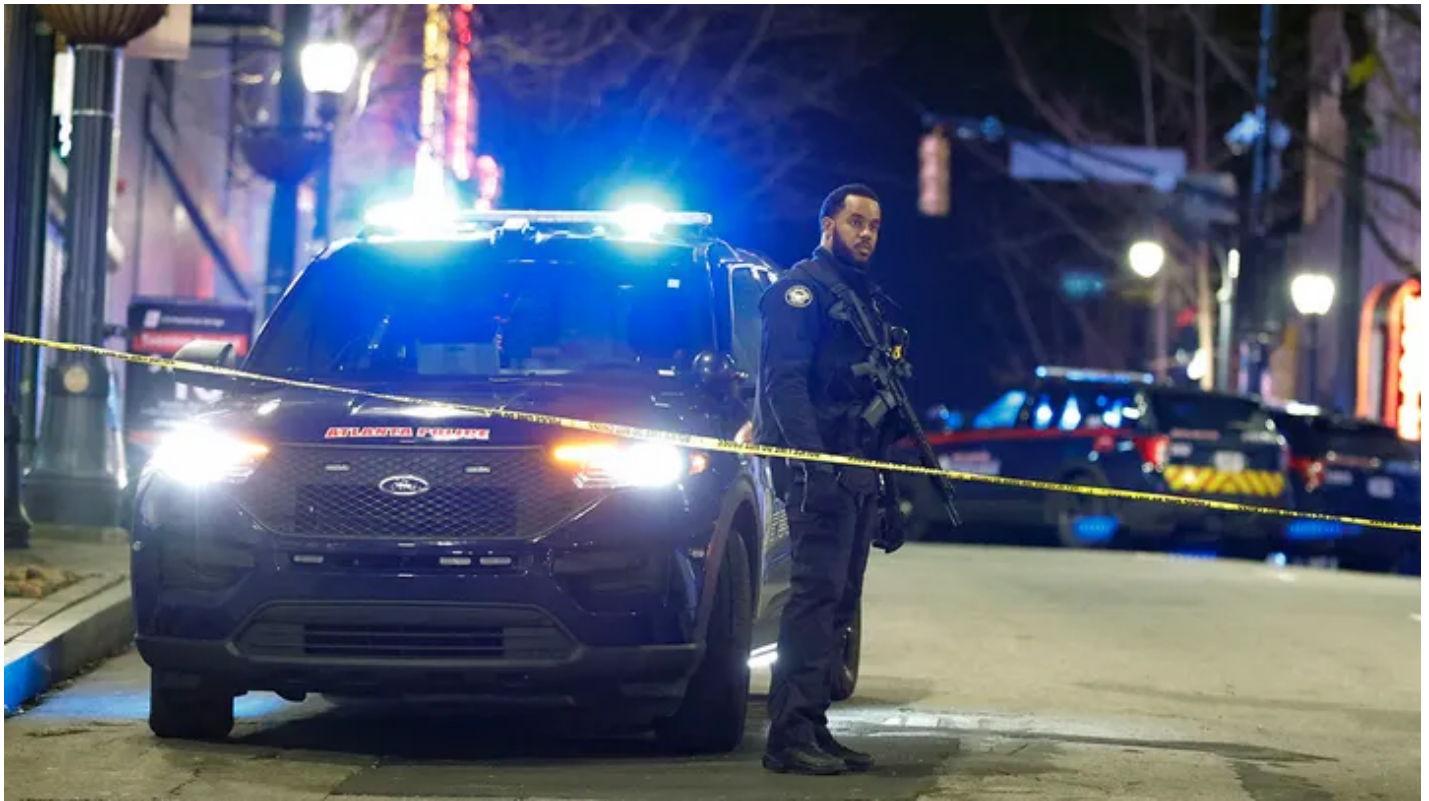
Police block downtown streets following a protest, Saturday, Jan. 21, 2023, in Atlanta.