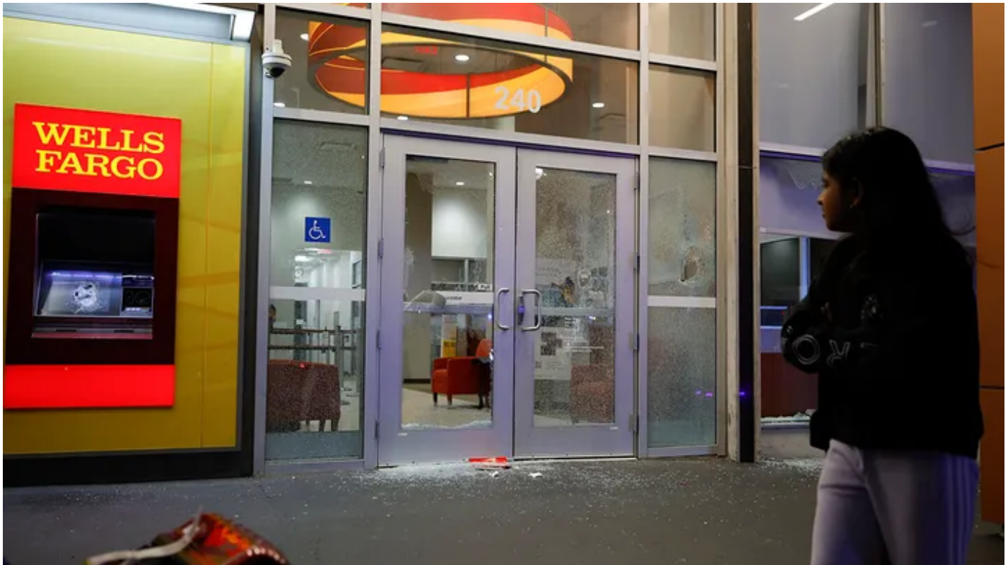
People walk by broken windows at a Wells Fargo branch following a violent protest, late Saturday, Jan. 21, 2023, in Atlanta.

While Dickens declined to respond to Greene's remarks, he agreed the riots constitute "domestic terrorism."