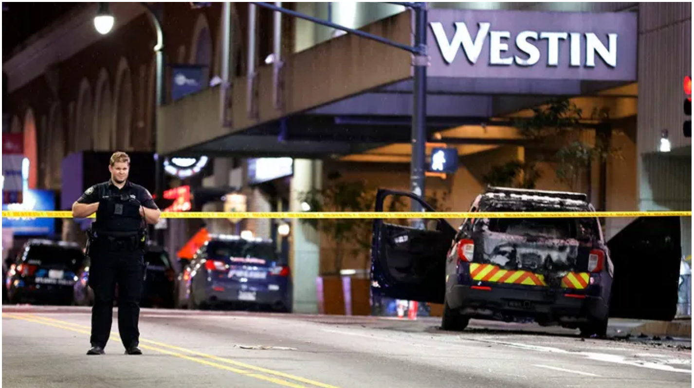
A police officer blocks a downtown street following a protest, Saturday, Jan. 21, 2023, in Atlanta.

"When you say people from out of town, they're carrying explosives. Is this an organized movement here?" Brennan responded, noting how Atlanta newspapers cite possible links to "environmental activists, radical anarchist and black revolutionaries." Brennan also cited claims from Rep. Marjorie Taylor Greene, R-Ga., blaming Democrats for condoning Black Lives Matter and Antifa.