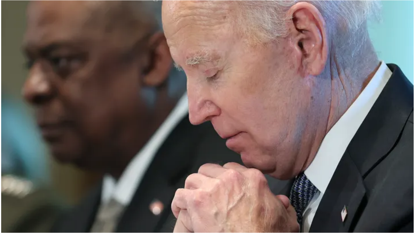
President Biden meets with Secretary of Defense Lloyd Austin, left, members of the Joint Chiefs of Staff, and combatant commanders in the Cabinet Room of the White House April 20, 2022, in Washington, D.C.

Kirby told reporters that Biden "still believes that repealing the mandate is a mistake," but added, "He also obviously believes that it's important to fund our military."