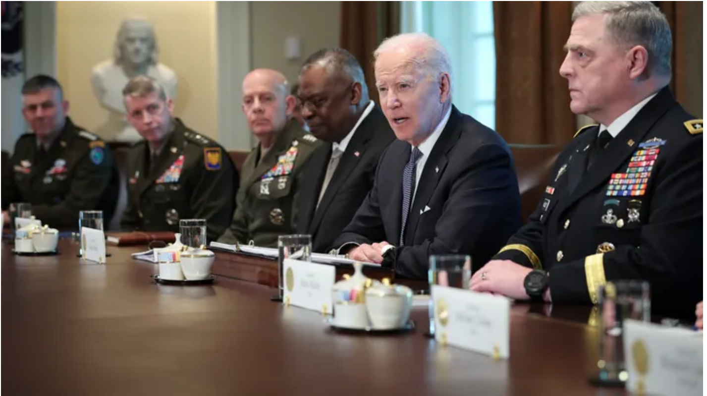
President Biden meets with Secretary of Defense Lloyd Austin, third from the right, Chairman of the Joint Chiefs of Staff Gen. Mark Milley, right, Commandant of the Marine Corps Gen. David Berger, third from the left, members of the Joint Chiefs of Staff, and combatant commanders in the Cabinet Room of the White House April 20, 2022, in Washington, D.C.