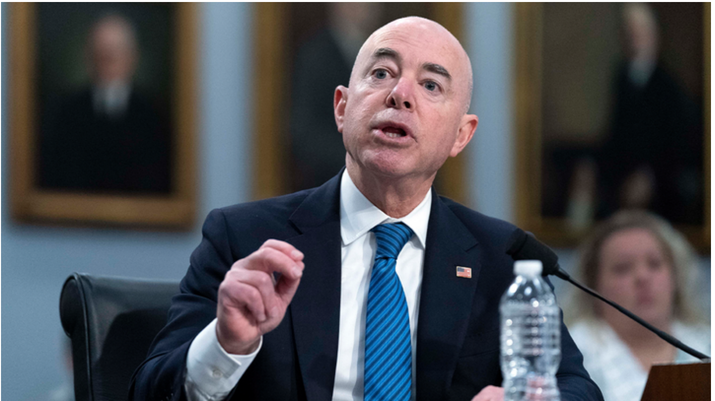
DHS Secretary Alejandro Mayorkas testifies during an April 2022 House hearing

These latest developments come a week after DHS Secretary Alejandro Mayorkas responded to questions regarding the agency's handling of the migration crisis at the southern border when speaking at the Center for Strategic and International Studies.