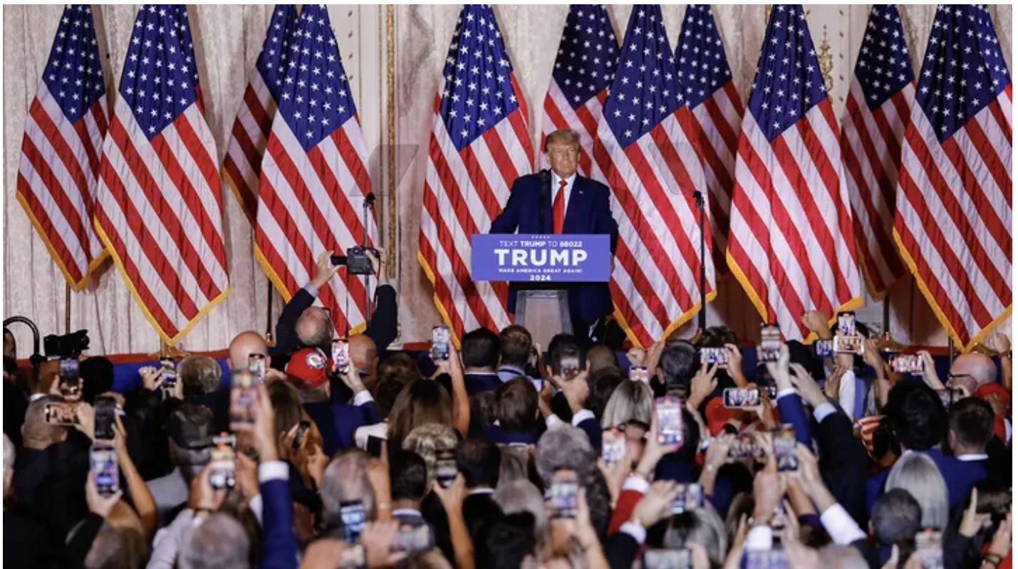
Former President Trump, during an announcement at his Mar-a-Lago Club in Palm Beach, Florida, Tuesday, Nov. 15, 2022, launches a third campaign for the White House.

Among Republicans, 47% wanted him to run again, down from 60% in July. Forty-five percent of GOP voters do not want him making another presidential bid.