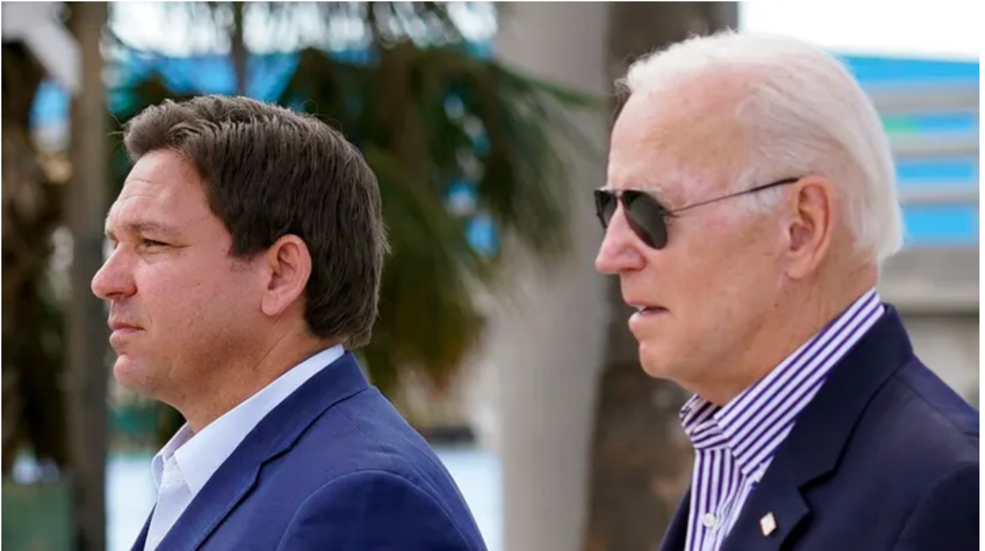
President Biden and Florida Gov. Ron DeSantis arrive to tour an area impacted by Hurricane Ian on Wednesday, Oct. 5, 2022, in Fort Myers Beach, Florida.

While the poll points to Biden's favorable ratings ticking up in recent months — although they are still underwater — support for him seeking a second term has declined from 45% in autumn to 40% now. Among all voters, less than a quarter of those questioned said they wanted to see Biden seek a second term in the White House, with just over two-thirds saying no.