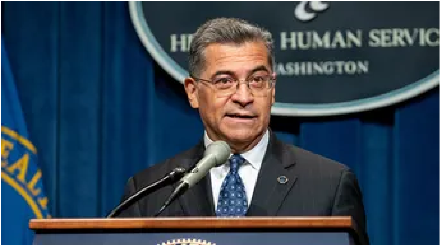
Department of Health and Human Services Secretary Xavier Becerra speaks during a news conference at the department's headquarters in Washington on June 28, 2022.

The White House said it has made more than 1.1 million vaccine doses available and helped boost domestic diagnostic capacity to 80,000 tests per week.