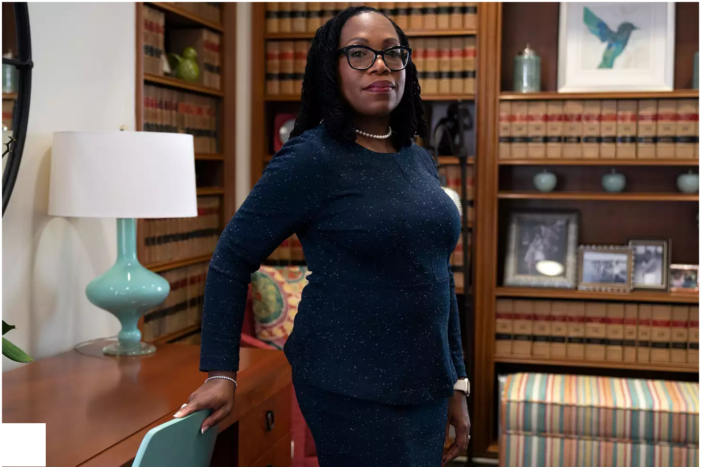
Ketanji Brown Jackson

Harris — whose parents were Indian and Jamaican and who has been some kind of first in many of her roles through the years — knows well that shattering barriers can leave cuts.